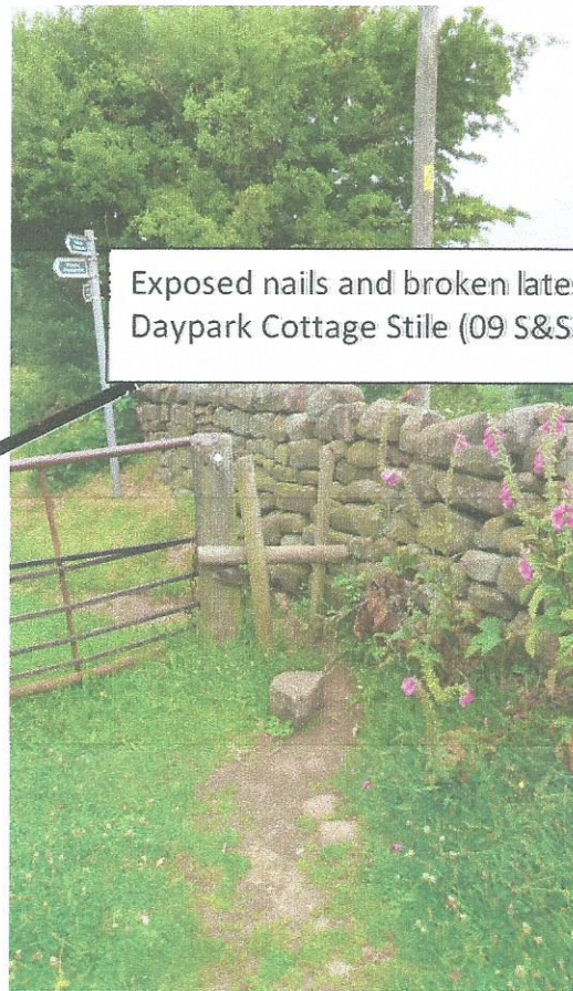
Exposed nails and broken lateral on Daypark Cottage Stile (09 S&SS) on map