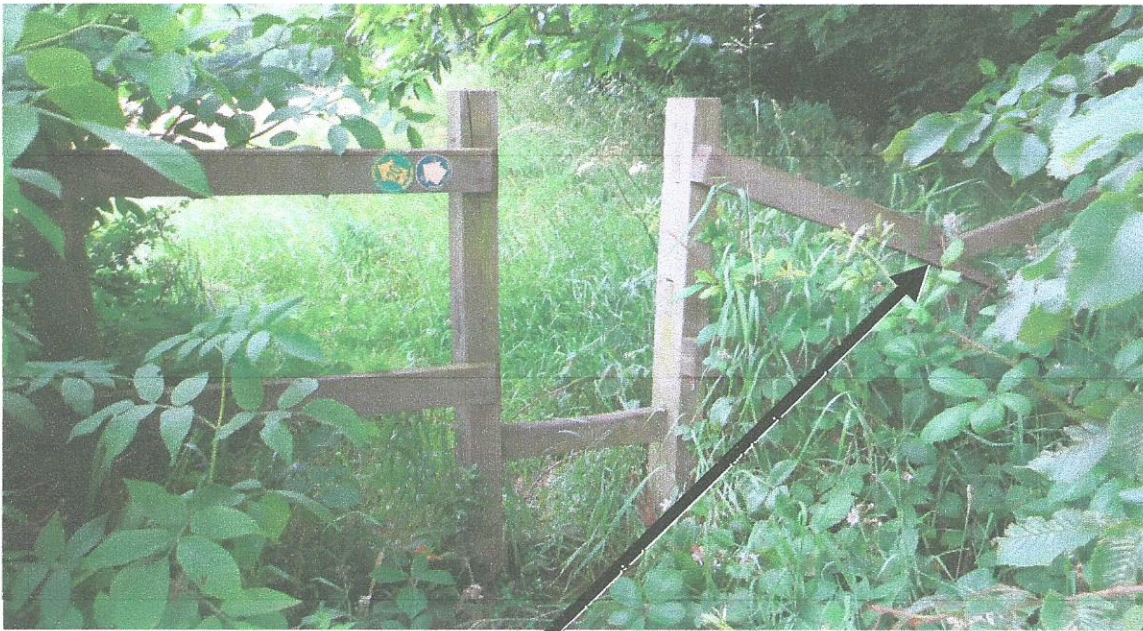
Broken lateral on Stile by Daypark Quarry (03 S on map).